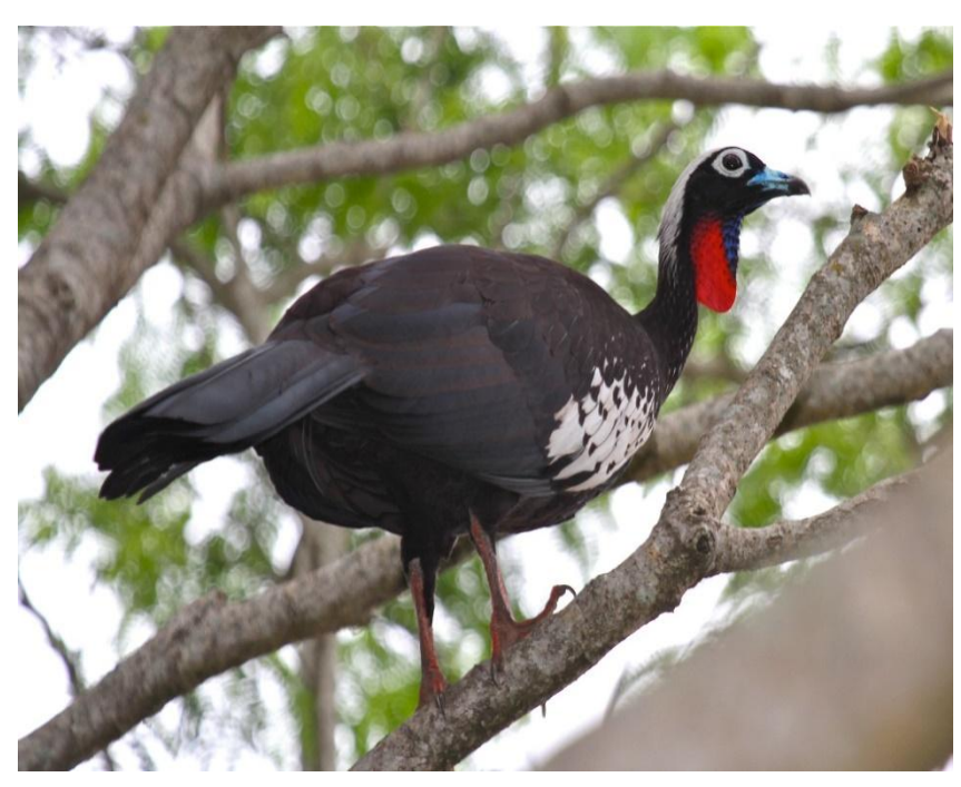
The endangered Black-fronted Piping-Guan is one of the most sought-after of the many regional endemics to be found at Intervales State Park.

Special attention will be devoted to searching for the Helmeted Woodpecker, one of the rarest and most localized of all Atlantic Forest endemics, but one which seems to be more often found at Intervales than elsewhere, and one which we've seen on more than 50% of our visits. We will plan to visit leks of two endemic hummingbirds, the Dusky-throated Hermit and the Purple-crowned Plovercrest.