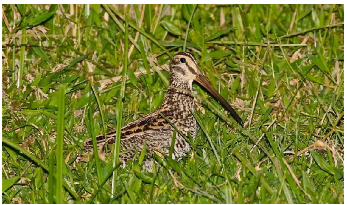
Giant Snipe is not an Atlantic Forest endemic, but this striking, crepuscular snipe is uncommon and patchily distributed throughout its range, and is rarely seen anywhere. We've enjoyed excellent luck with this iconic bird during each of our recent visits to the Itatiaia region.

November 5-6, Days 17-18: Itatiaia to Rio de Janeiro; Departures for Home . After some final early-morning birding at Itatiaia, and lunch en route to Rio (quite possibly followed by one more nearby birding stop), we will spend the afternoon of November 5 driving to Rio de Janeiro, where we will continue directly to Rio's Galeãao International Airport (airport code GIG) with plenty of time for participants to make their evening international flights. Participants can choose from a variety of overnight flights to the U.S., which will arrive on the morning of November 6, in time for homeward connections. For participants wishing to extend their time in Rio to take in the sights and culture of this amazing city, separate arrangements can be coordinated through VENT's local ground agent. Upon request, VENT will be happy to help with these arrangements.