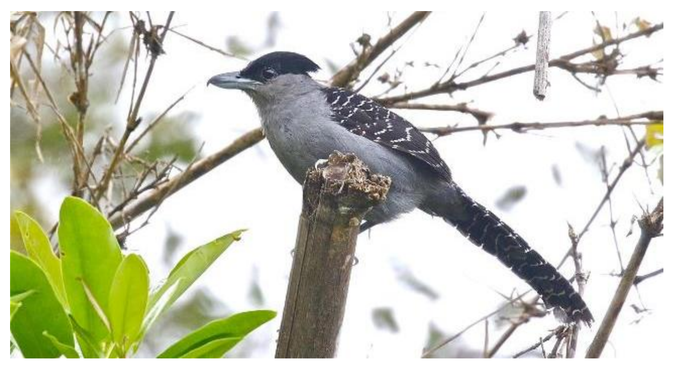
The aptly named Giant Antshrike is nearly as large as a Squirrel Cuckoo. It could turn up at either Intervales or Itatiaia, and is an instant trip highlight when it does!