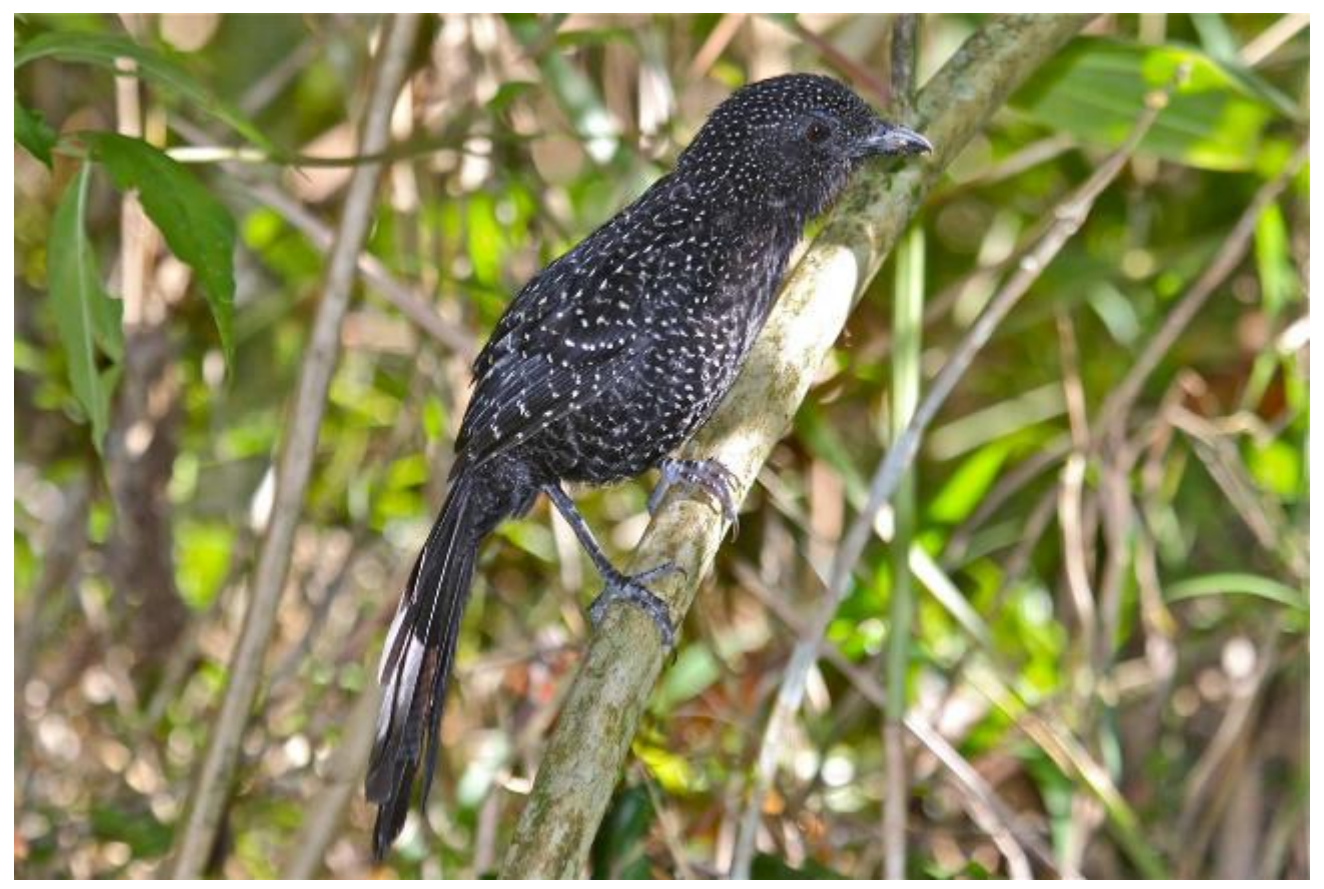
The Large-tailed Antshrike (male pictured here) is a sublimely beautiful endemic that is typical of higher elevation bamboo thickets and shrubby forest borders.

October 30, Day 11: Ubatuba to Paraty. We'll probably spend most of this morning birding the Ubatuba area, likely concentrating our efforts along the Folha Seca Road. The sandy soil here supports a somewhat stunted forest with a slightly different mix of birds from that found on the slopes of the nearby Serra do Mar. Among the possibilities are Orange-eyed Thornbird, Tawny-throated and Rufous-breasted leaftossers, Black-capped Foliage-gleaner, Spot-backed Antshrike, Unicolored Antwren, Scaled Antbird, Black-cheeked Gnateater, Spotted Bamboowren, Slaty Bristlefront (northern vocal type), Bay-ringed Tyrannulet, Eye-ringed Tody-Tyrant and Long-billed Wren. When our Ubatuba birding is concluded, we'll make the short (about one hour) drive north to the historic coastal town of Paraty, where we will plan to visit some stands of mangrove