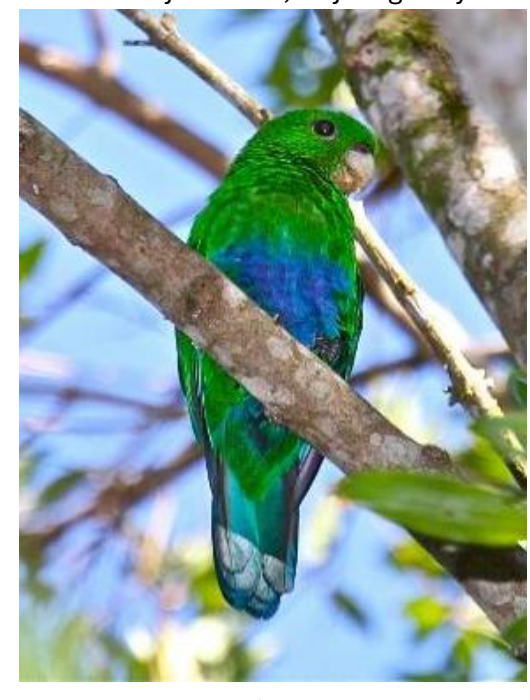
Intervales State Park is one of the best places to see the unique (it has its own genus!), endemic, Blue-bellied Parrot, although we are only rarely lucky enough to get such great views of a perched male as this.

Intervales is a particularly good spot for several of the more localized Atlantic Forest endemics, among them, Spot-winged Wood-Quail, White-bearded Antshrike, Squamate Antbird, Slaty Bristlefront (southern vocal type, soon to be described as a new species), Spotted Bamboowren, "Atlantic" Royal-Flycatcher, Oustalet's Tyrannulet, Bay-ringed Tyrannulet, Red-ruffed Fruitcrow, and Half-collared Sparrow. Likewise,