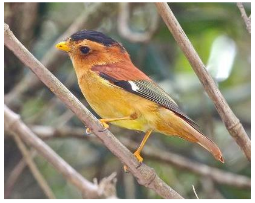
Black-capped Piprites is one of several specialties that we'll search for in the Agulhas Negras high country.

Even the grounds of our charming hotel are exceptionally productive for birds and nearby hummingbird feeders can produce a nearly non-stop show. Photographers will enjoy opportunity to train their cameras at leisure on such jewels as Frilled Coquette, Black Jacobin, Violet-capped Woodnymph, and Brazilian Ruby. Depending on the availability of fruiting trees in the surrounding forest (which depends on rainfall and temperature patterns), fruit feeders at the lodge may also attract a steady stream of tanagers ventbird.com