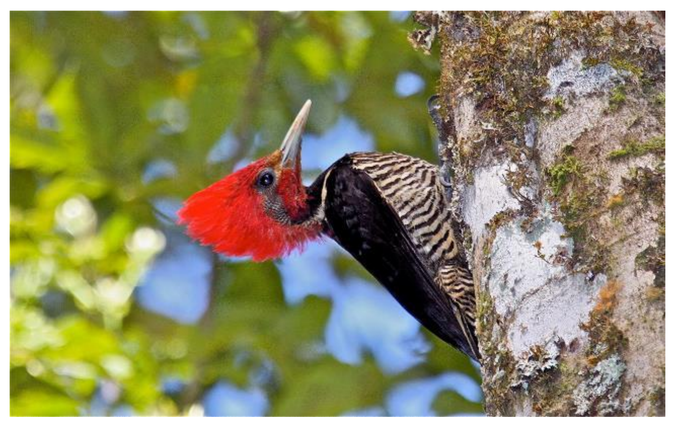
The Helmeted Woodpecker (male pictured here) is one of the rarest and most difficult to find of all of the Atlantic Forest endemics. It was only recently moved to the genus Celeus , after previously having been incorrectly placed in the genus Dryocopus . Its strong plumage similarities to the sympatric and much larger Robust and Lineated woodpeckers are thought to represent an example of Interspecific Social Dominance Mimicry (ISDM), an evolutionary adaption to avoid aggression from similar looking, but larger and more dominant species.