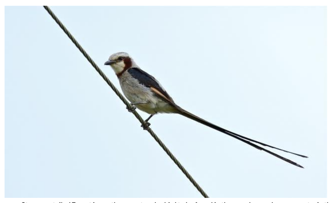
Streamer-tailed Tyrant is another spectacular bird to be found in the marshes and open country in the Itatiaia region. The displays of duetting pairs or family groups of these birds are simultaneously comical and impressive.