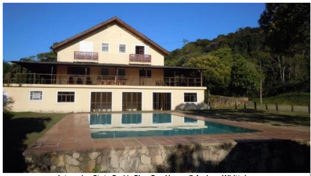
Intervales State Park's Pica-Pau House

NIGHT (October 21): Intervales State Park