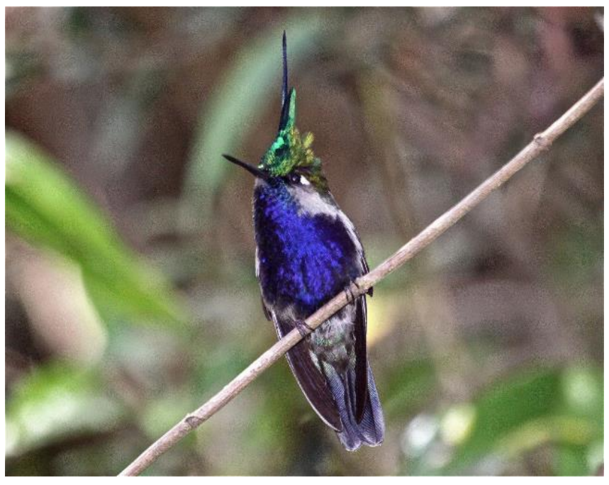
The Green-crowned Plovercrest, another denizen of the Agulhas Negras highlands, is arguably even more spectacular than its sibling species, the 12 Southeastern Brazil:

November 1-4, Days 13-16: Itatiaia National Park. Established in 1937, Itatiaia was Brazil's first national park. It protects more than 65,000 acres of montane Atlantic Forest in the Serra da Mantiqueira range, which straddles the border between the neighboring states of Rio de Janeiro and Minas Gerais. Four full days and part of a fifth morning here will give us a nice introduction to its avian riches and allow us to savor the park's scenic beauty and pleasant climate. A combination of roads and trails will enable us to cover various elevational levels of the park, each with its own special