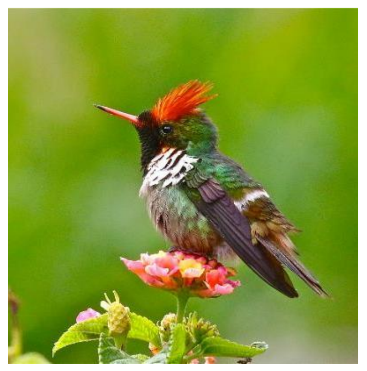
Frilled Coquettes are frequent visitors to flowering Lantana and the feeders at our lovely lodge in Itatiaia National Park.