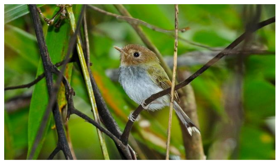
Fork-tailed Pygmy-Tyrant is an uncommon and patchily distributed endemic that we often see in the Ubatuba area. This distinctive little flycatcher is strongly associated with thickets of native bamboo.

Afternoon plans are certain to include a visit to Sítio Folha Seca, another privately owned property that boasts one of the most spectacular hummingbird shows that we have ever seen. Among the 10-15 species (and hundreds of individuals) that we can expect to see are the spectacular Saw-billed Hermit and Festive Coquette —in fact, this is arguably the best place in the world to see both of these Atlantic Forest endemics. In addition to the masses of hummingbirds swarming the feeders for sugar water, the fruit feeders at Folha Seca serve to attract a steady stream of various colorful frugivores, including Red-necked, Green-headed, and Ruby-crowned tanagers; Blue Dacnis; Green Honeycreeper; and Chestnut-bellied and Violaceous euphonias.