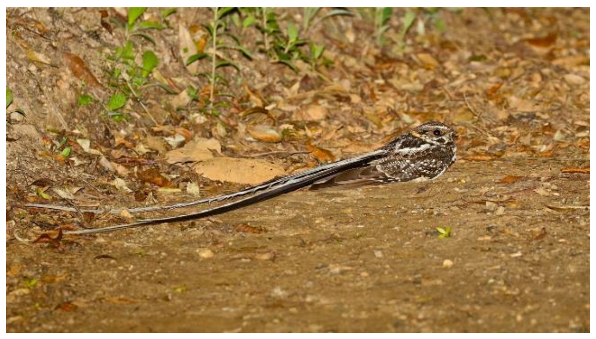
The spectacular and endemic Long-trained Nightjar is one of the primary targets of our planned night birding excursion at Intervales State Park.

Once the entire group has convened on October 21, we will allow a brief time for restroom breaks, money exchange, etc., before beginning our four to five-hour drive to Intervales (with lunch en route). We will hope to arrive at Intervales in the late afternoon, with time to check into our rooms before dusk, which would allow (weather permitting) for a first try at seeing the Long-trained Nightjar and other nightbirds, prior to dinner.