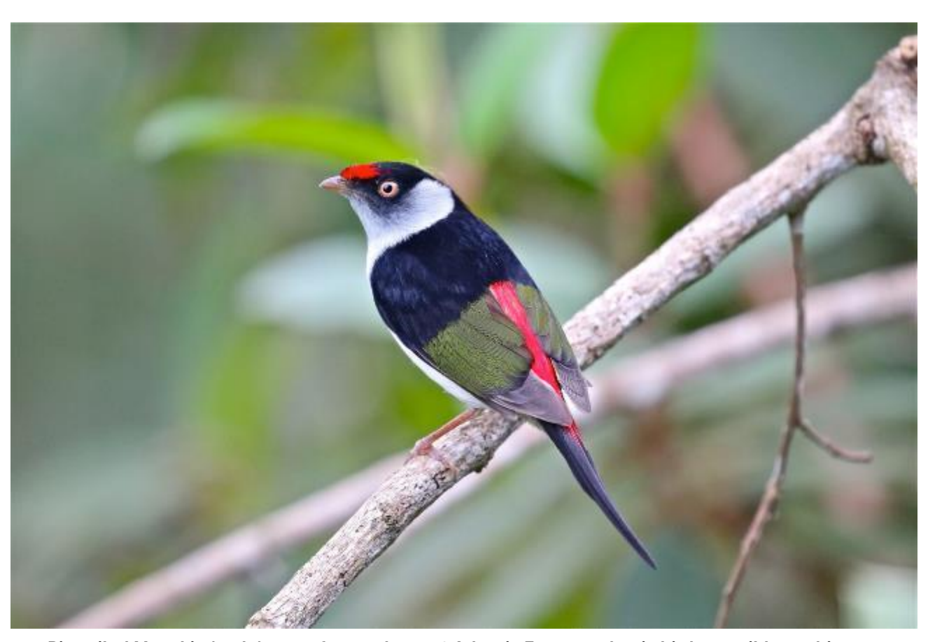
Pin-tailed Manakin (male), one of more than 150 Atlantic Forest endemic birds possible on this tour Photographed at Itatiaia National Park © Kevin Zimmer

South America's largest country is also one of its richest for birds. Nowhere is this more apparent than in southeastern Brazil, where habitats range from coastal rain forest and wet pampas to montane cloud forest and plateau grassland. Long isolated from Amazonia by the dry brushlands of central Brazil (left in the wake of receding glaciers during the last ice age), the avifauna of southeast Brazil has radiated in a myriad of directions. Today there are more than