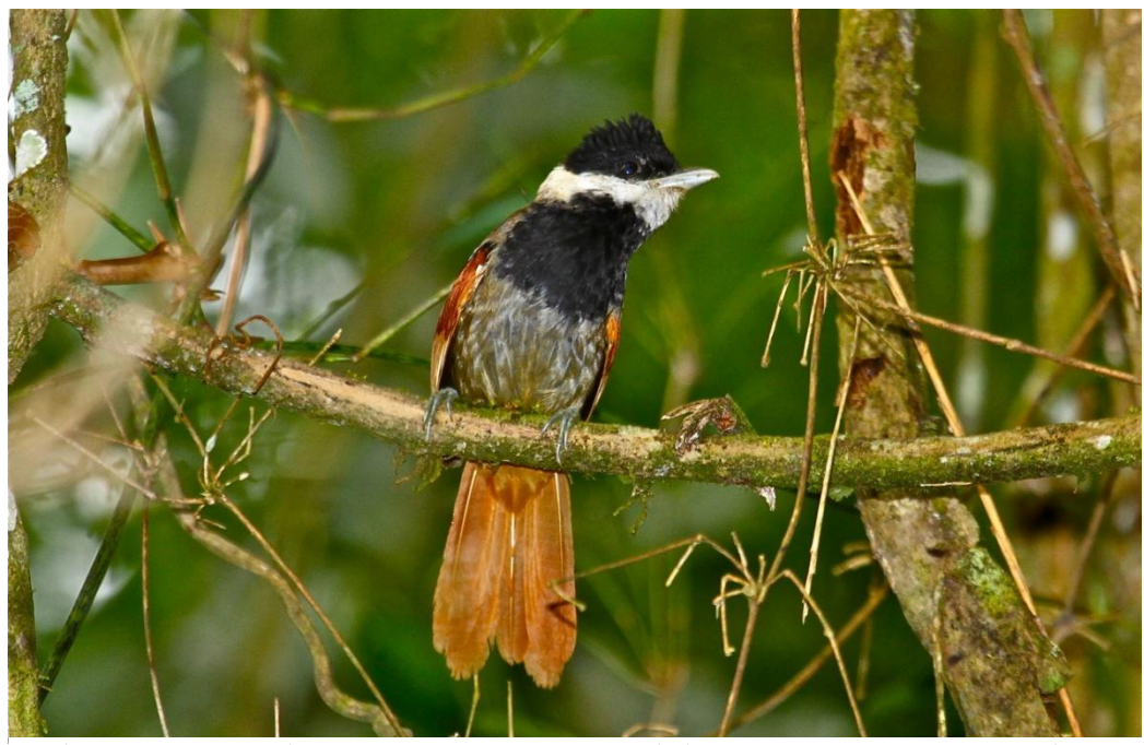
White-bearded Antshrike (male), a rare bamboo-specialist, and one that we have not failed to see on our Southeastern Brazil tours since 1993

October 27, Day 8: <u>Intervales</u> to Ubatuba, with Afternoon Birding Near Moji das Cruzes. Today will be devoted mostly to travel with a fairly early start, as we have a long drive from Intervales to Ubatuba, São via Paulo. We'll break up the drive with a stop at some marshes near Moji das Cruzes