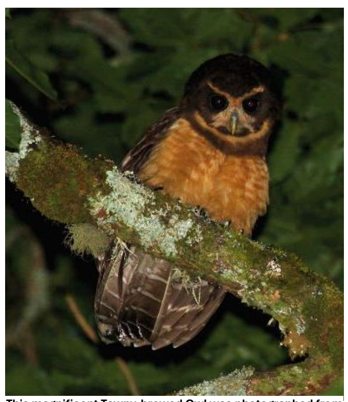
This magnificent Tawny-browed Owl was photographed from the parking lot at our lodge in Itatiaia National Park.

Rufous-breasted Buff-browed foliage-gleaners; Leaftosser; Large-tailed, Tufted, White-bearded and Giant antshrikes; and Spot-breasted Rufous-backed antvireos; Star-throated Antwren; Ferruginous, Rufous-tailed. Bertoni's Ochre-rumped antbirds; White-shouldered Fire-eye; Rufous-tailed and Such's (Cryptic) antthrushes; Speckle-breasted Antpitta; Rufous Gnateater; Slaty Bristlefront (northern vocal type); Mouse-colored Tapaculo; Pin-tailed Manakin; Black-capped Piprites; Drab- breasted and Brownbreasted pygmy-tyrants (bamboo-tyrants); Forktailed Pygmy-Tyrant; Shear-tailed Gray-Tyrant; Rufous-tailed Attila; Serra do Mar Tyrannulet; Olivaceous Elaenia; Tanager; Thick-billed Saltator; Bay-chested and Buff-throated warbling-finches; and many more.