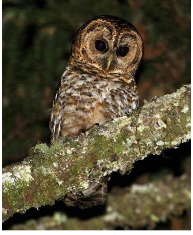
Rusty-barred Owl, yet another regional endemic that we hope to see at Intervales State Park

Mornings will find us working a variety of jeep tracks through lush, foothill Atlantic Forest. These tracks are ideal for groups—wide enough to comfortably accommodate everyone, yet narrow enough to be part of the surrounding forest. Constantly moving mixed-species flocks of colorful tanagers (including Brassy-breasted, Chestnut-backed, Red-necked, Green-headed, Diademed and Azureshouldered) and challenging woodcreepers,