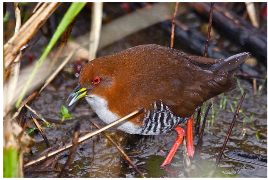
Red-and-white Crake, a lovely "phantom of the marsh" that we often connect with at one of our stops during the tour

and Biritiba-Mirim, where we will search for the recently described endemic "São Paulo" Antwren. This marsh-dwelling antwren is currently considered to represent distinctive and previously unknown subspecies of the Marsh (Paraná) Antwren of Paraná and Santa Catarina, and is known from only a couple of marshes in São Paulo state. Other bird possibilities from these marshes include Red-andwhite Crake, Blackish Rail, Orange-Thornbird, breasted Spix's Spinetail, Rufous-capped Antshrike, Bran-colored Flycatcher, Masked Yellowthroat and Brazilian Tanager.