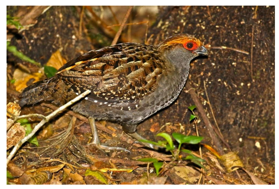
Spot-winged Wood-Quail is one of many elusive forest birds at Intervales that will require a focused effort to see.

adjacent Fazenda Capricornio. These are excellent spots for the endemic Buffseeing throated Purpletuft, the tiniest member of the genus lodopleura, group formerly placed with the cotingas, but now considered to be of uncertain taxonomic affinities. Other possibilities here include Mantled and Whitenecked hawks, Spot-billed Toucanet, Buff-bellied and Crescent-chested puffbirds, Pale-browed Treehunter (subspecies C. l. holti, a likely split from more northern nominate leucophrus),