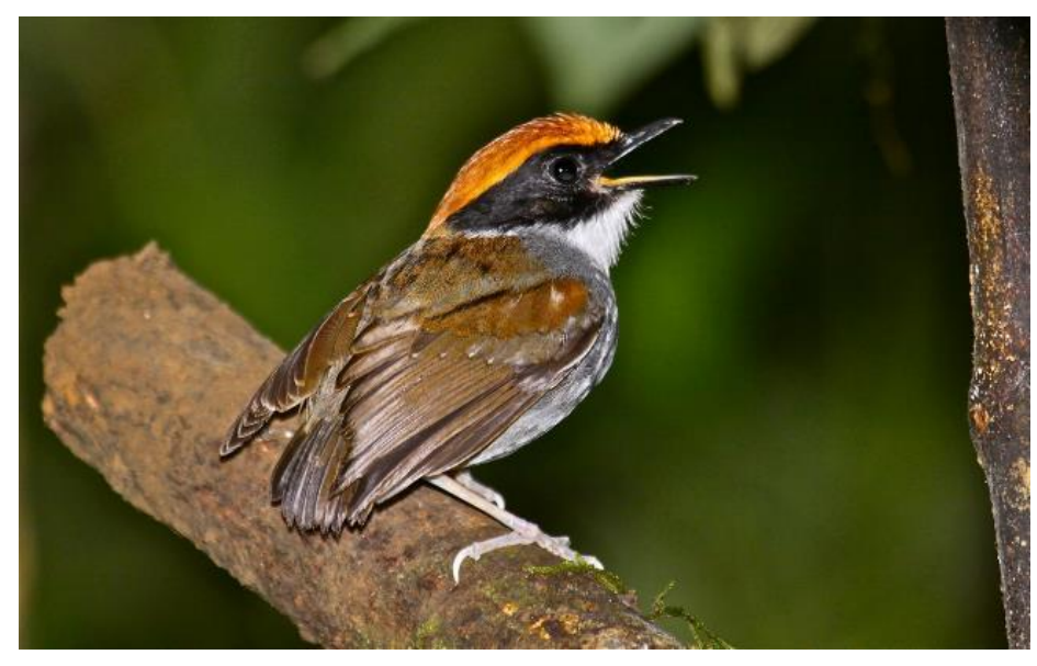
Several sites in the Ubatuba region are particularly good places to see the handsome Black-cheeked Gnateater, the male of which, is pictured here

October 31, Day 12: Morning Birding at Perequé, Followed by Afternoon Drive to Itatiaia National Park. This morning, we will journey a short distance north, to bird the second growth forest and overgrown plantations in the coastal lowlands near Pereque. Our primary target will