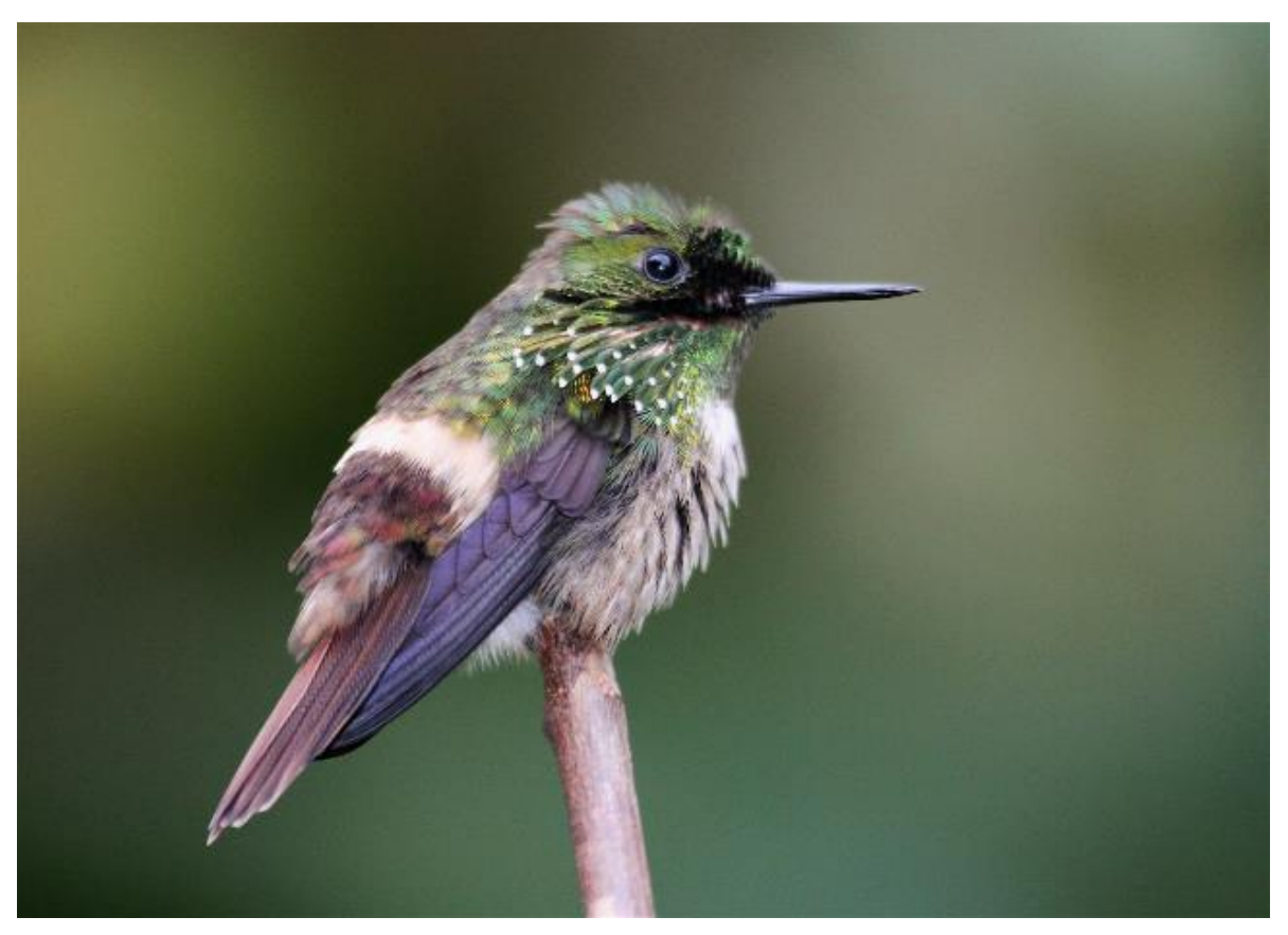
Festive Coquette (nominate subspecies) is probably more readily seen at Sítio Folha Seca than at any other location in the world.