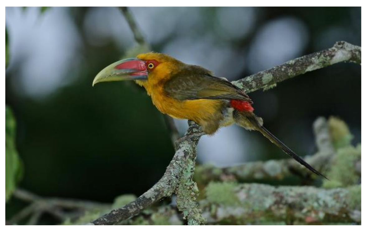
Saffron Toucanets are also regular visitors to the lodge at Itatiaia National Park.