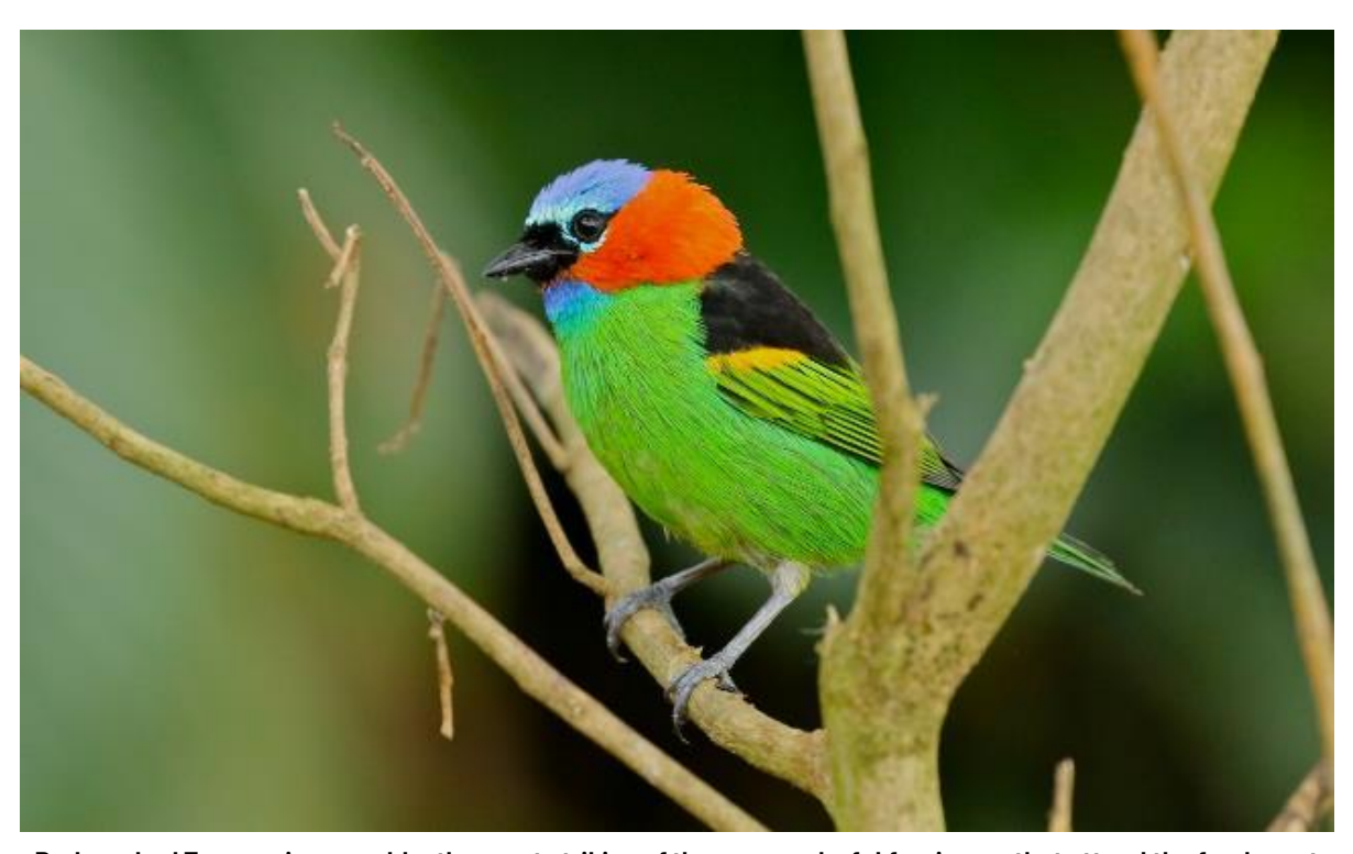
Red-necked Tanager is, arguably, the most striking of the many colorful frugivores that attend the feeders at Sítio Folha Seca