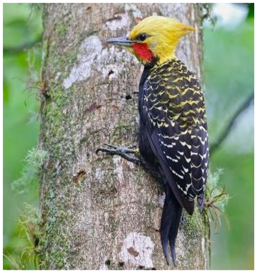
Few woodpeckers are fancier in appearance than the aptly named Blond-crested Woodpecker, a species that we usually see at Intervales, Ubatuba, and Peregue.